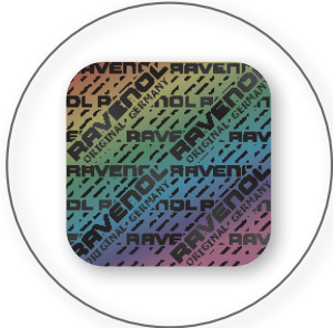
RAVENOL-Hologram for counterfeit product security.

The „Made in Germany“: Production in Germany – a powerful quality characteristic.