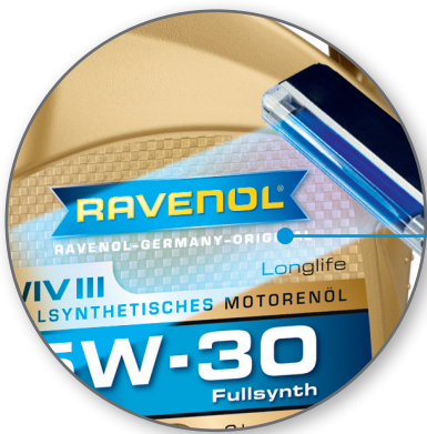
Additional Counterfeit product security: Under UV light the words "RAVENOL-GERMANY-ORIGINAL" will appear.

Label background is in the same colour as the individual containers for easy product identification . The Carbon look gives the consumer a feel for the sporting origins of the product.